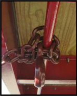
Picture shows chain loop being used to secure the binder to a tie bar beneath the trailer.